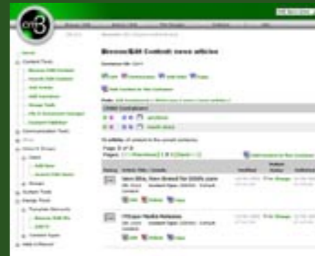
Above: An example of cm3 content manager's powerful administrative interface. You can read more about it at: www.ddsn.com/solutions/cm3

A flagship offering in this area is cm3 content manager – a product that already has a wide installation base within major organisations, and is distributed through a channel of other designers and developers. cm3 goes way beyond the requirements of most projects, but its low price point provides an ideal way to create a scalable underlying structure for your web project's future without major investment in proprietary or custom built technologies..