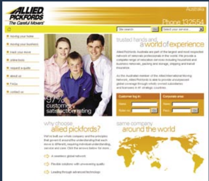
Above: The website in development for Allied Pickfords - soon to be launched.