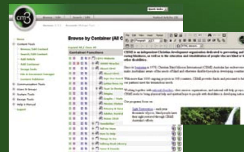
An example of cm3's explorer-like content browsing interface and WYSIWYG editor.